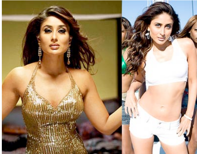
Kareena Kapoor, before and after her weight loss.

box office. 24 While Kapoor has been able to garner acclaim for her beauty, her performances, and her dancing abilities, the overwhelming importance of the male star in commercial cinema remains paramount.