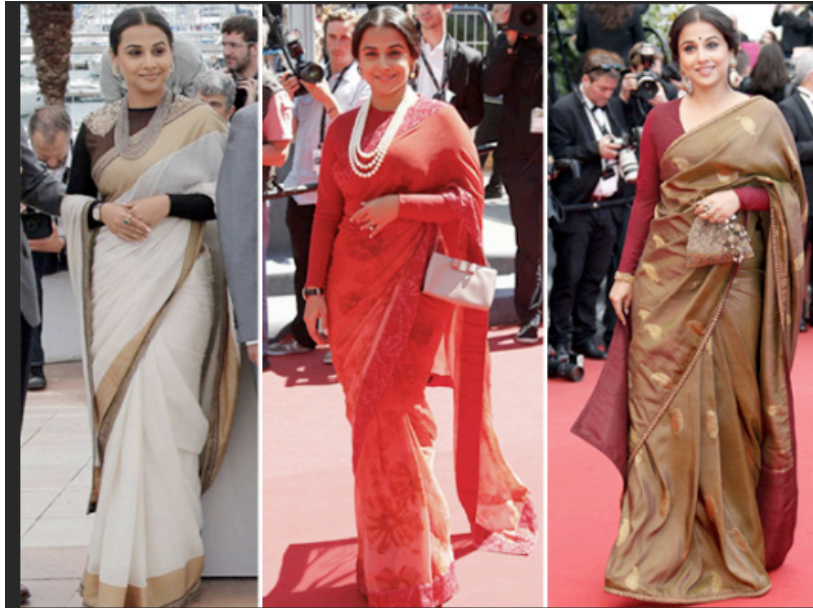
Vidya Balan at Cannes 2013, in her signature 'Indian look'.

Balan's contemporaries and leading actresses Kareena Kapoor and Priyanka Chopra both have credited her with having changed the face of the Hindi film heroine. When asked in an interview how she feels about being given this mantle, Balan emphasized the changing social climate of the country. She said,