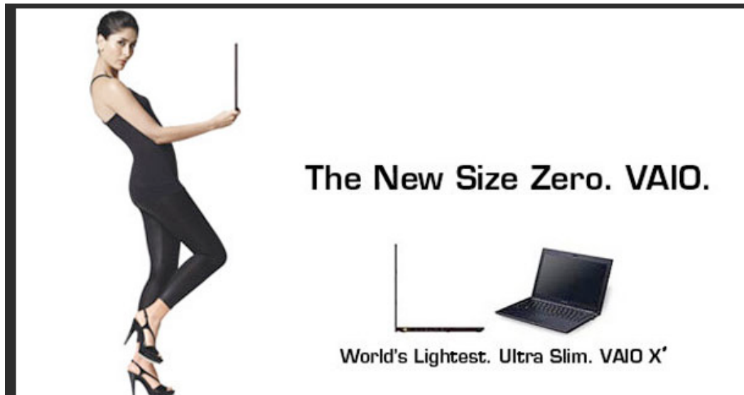
Kareena Kapoor in a print ad for Sony Viao 'size zero' laptops.

involved in her achieving a size zero body. She also states that despite the 'perfect body shape', she had to sit through several hours of make-up and other rigorous labour to do the now famous bikini scene where she unveiled her new body.